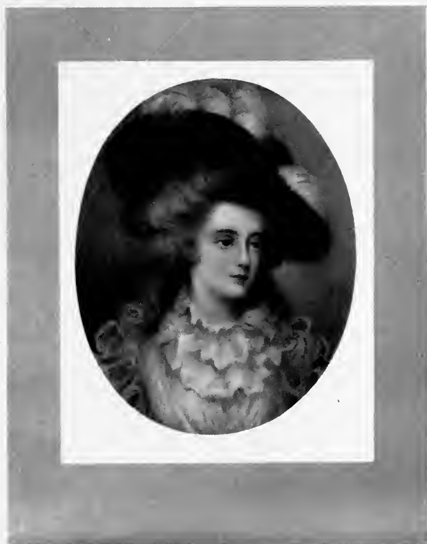
MISS VINCENT BY VASLET OF BATH